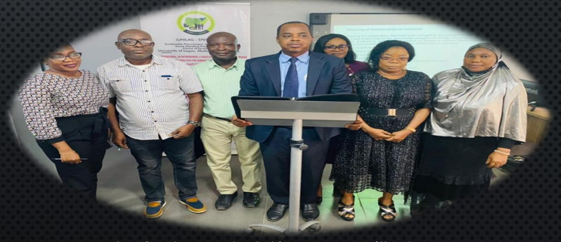
The Centre Leader taking a pose with class group B after group presentation