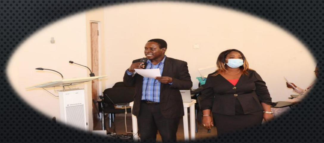
The Vice Chancellor, DVC Academic & Research, DG LSPPA, the UNILAG-SPESSCE team and all participants during the Inauguration ceremony