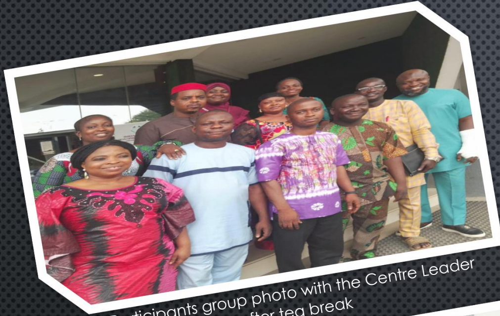
Participants group photo with the Centre Leader after tea break