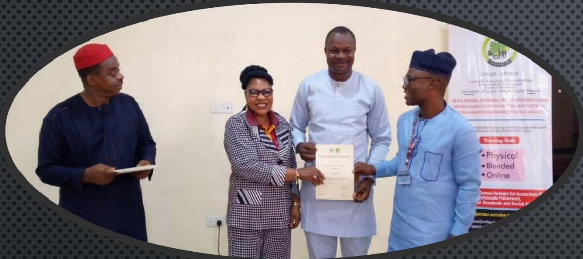
The Centre Leader, the Programme Coordinator & the Deputy Centre Leader Social Standards posing with a participant during certificate presentation