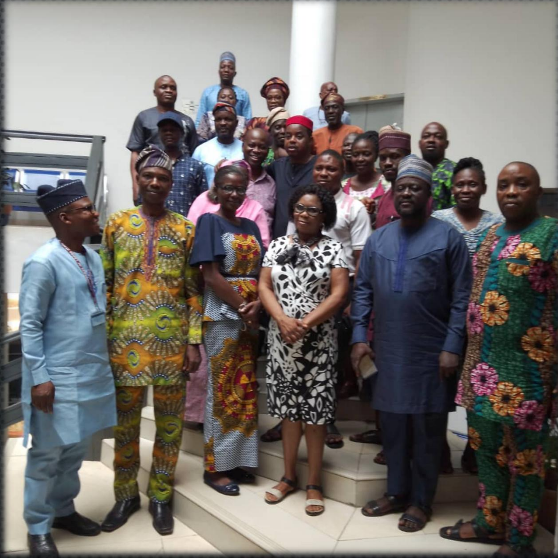
Group pictures with the Facilitators after tea break