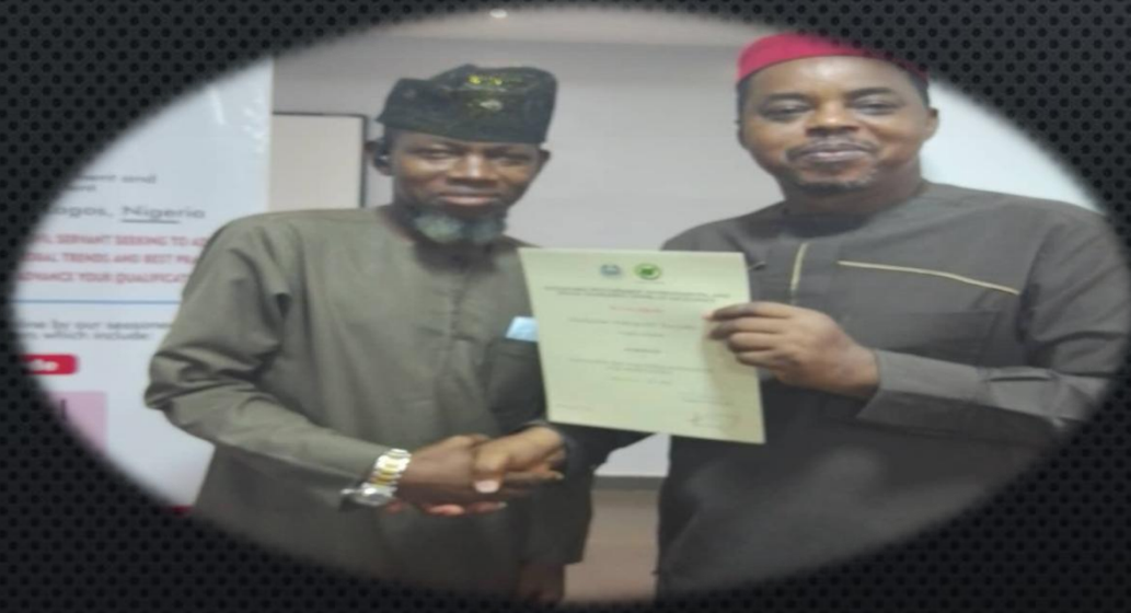
Presentation of certificates by the Centre Leader