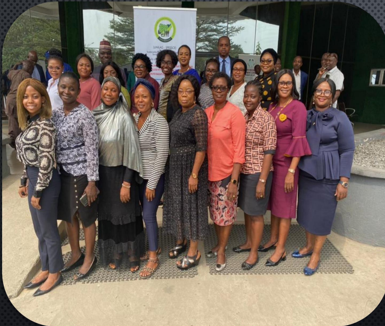
The Centre Leader taking group pictures with participants