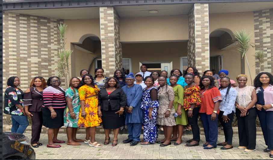
All participants group photograph with Centre Leader, the Programme Coordinator and the Deputy Centre Leader