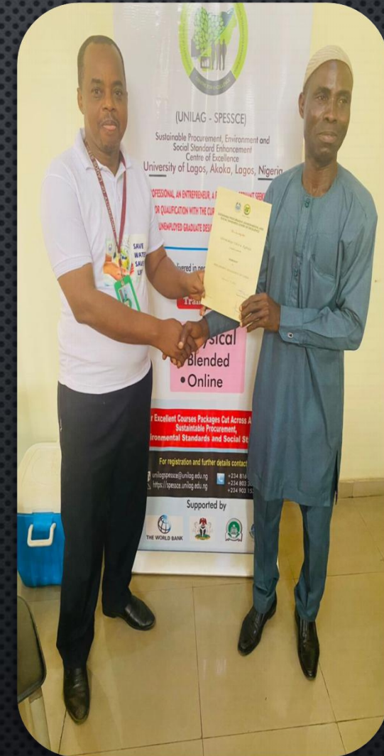
The Centre Leader presenting certificate to a male participants from LSPPA