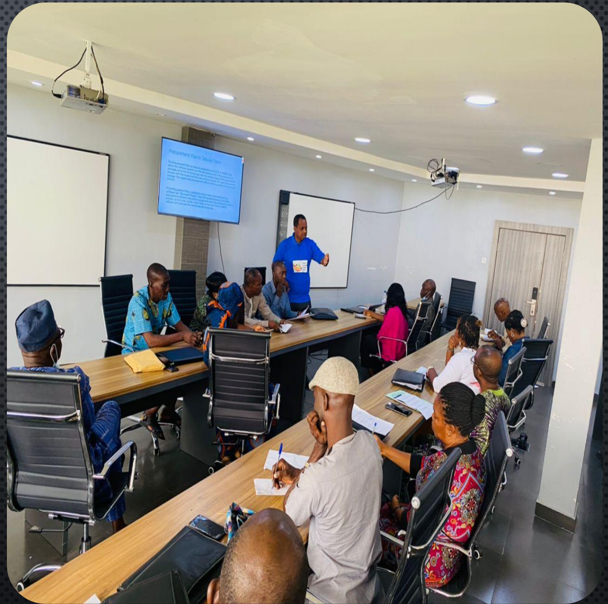
The Centre Leader Supervising a group presentation by the participants