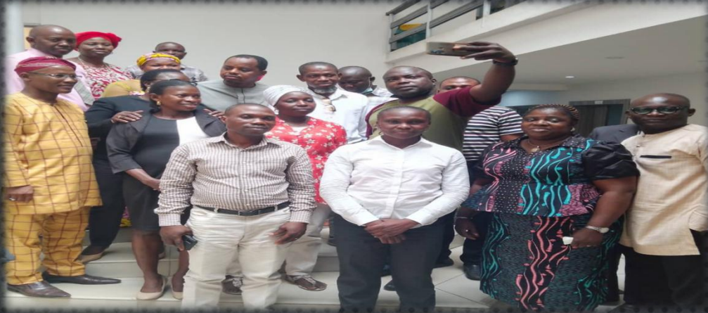
Participants group photographs after class