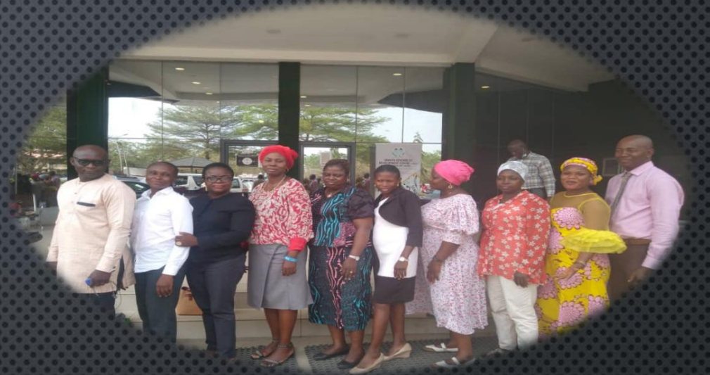
Participants posing for random group photographs