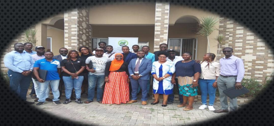
Group photo on Day 1 with the Centre Leader, Deputy Centre Leader and the Centre's Environmental and Social Safeguards Officer