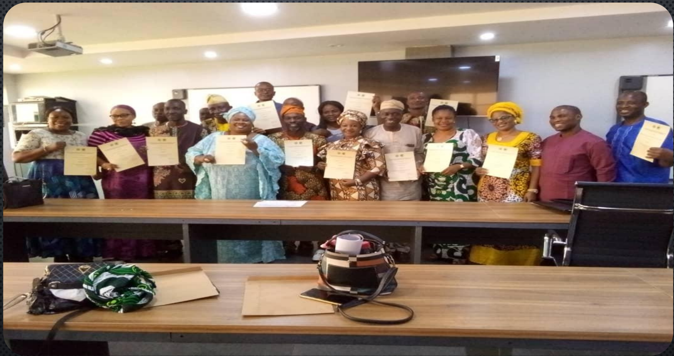
The Participants posing with their Certificates for group pictures