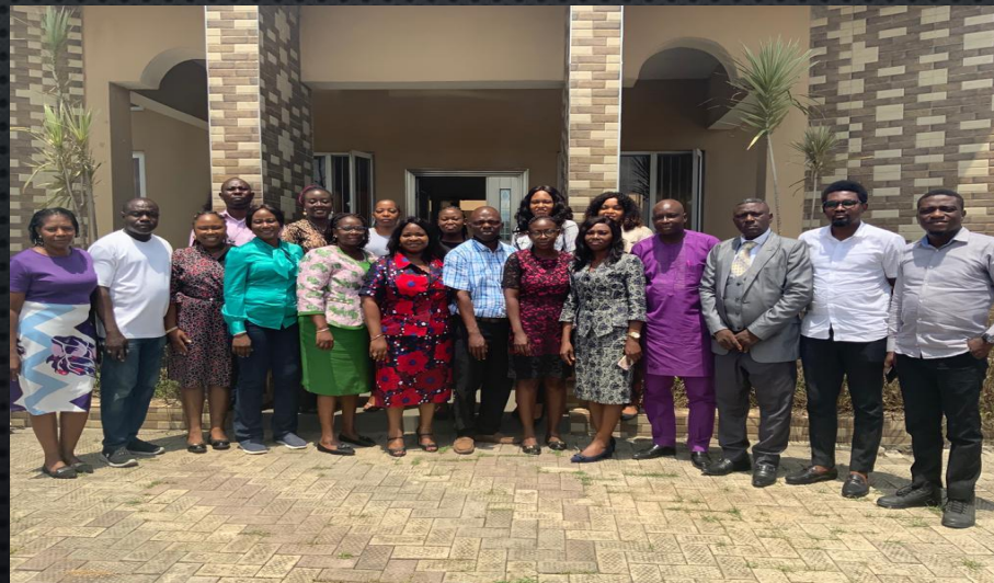
Participants posing for random photograph with the Deputy Centre Leader after class lectures