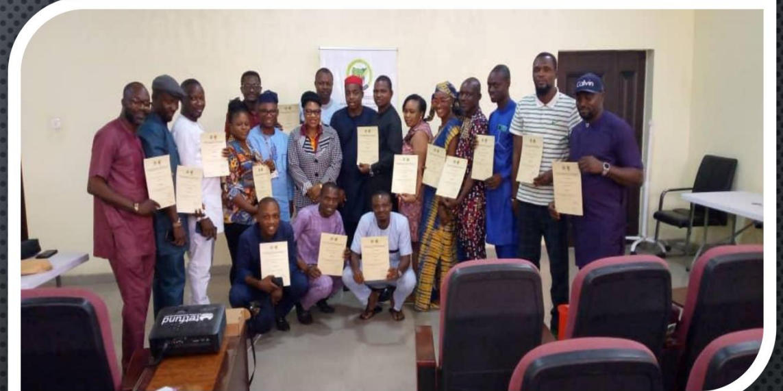
The participants posing with their certificates with the Facilitators and the Centre Leader