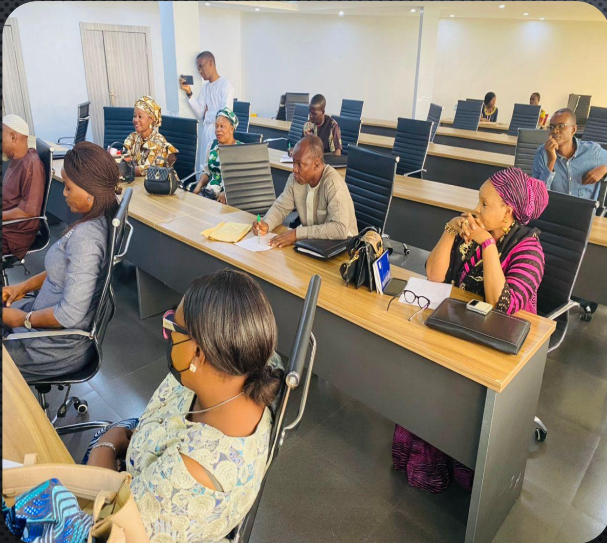
The participants taking notes during presentation by the facilitator