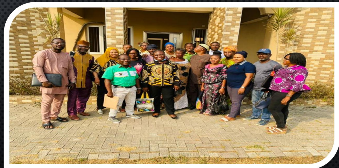
The participants having a group photograph