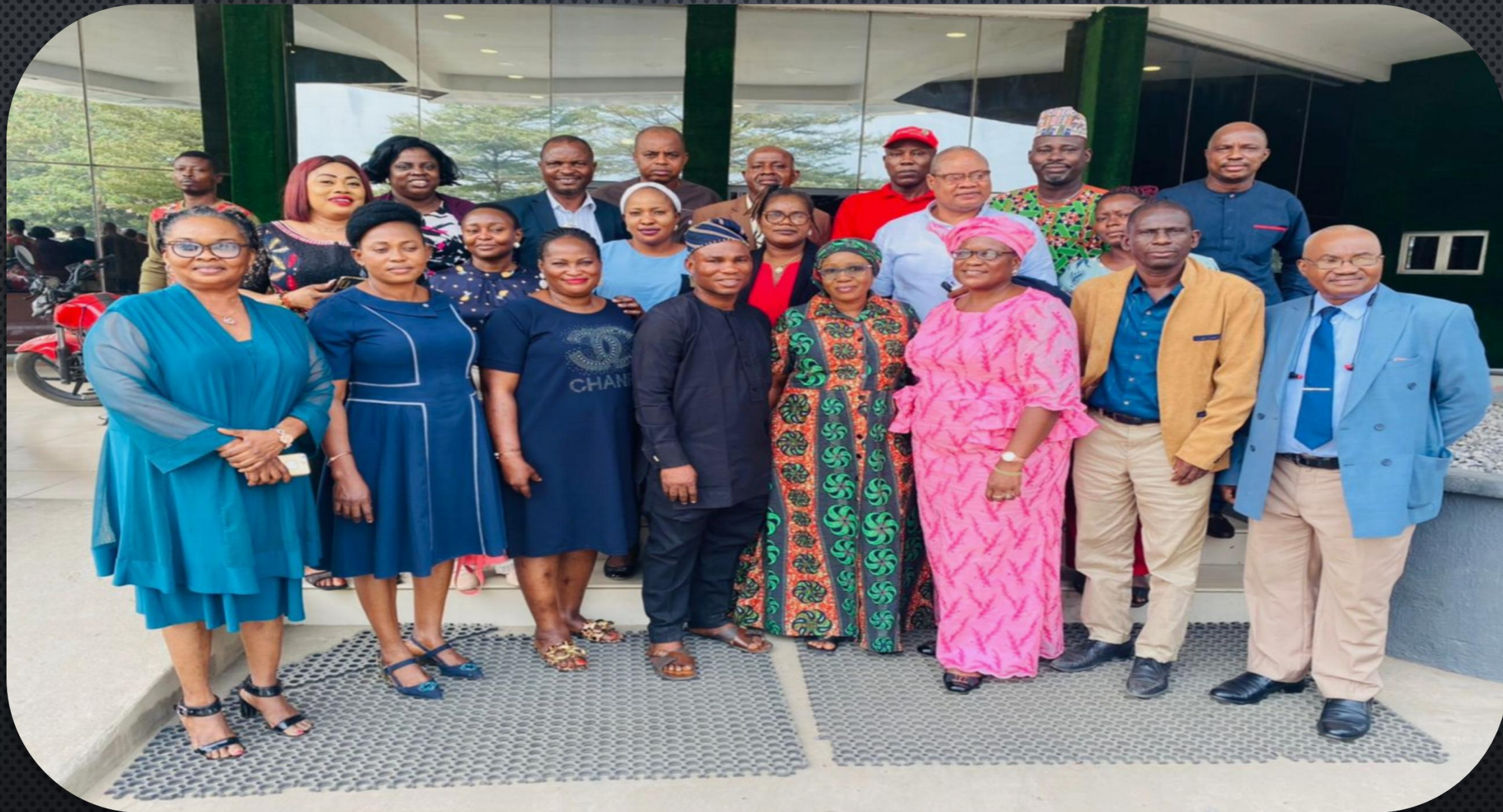
Group pictures with the participants on training Day 5