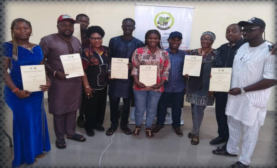
Participants taking photos with their certificates