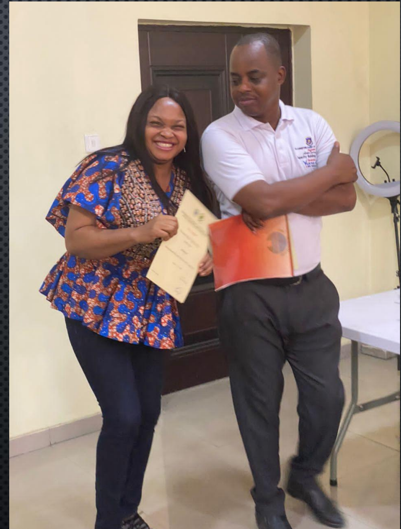
The Centre Leader posing with style during certificate presentation to the participants