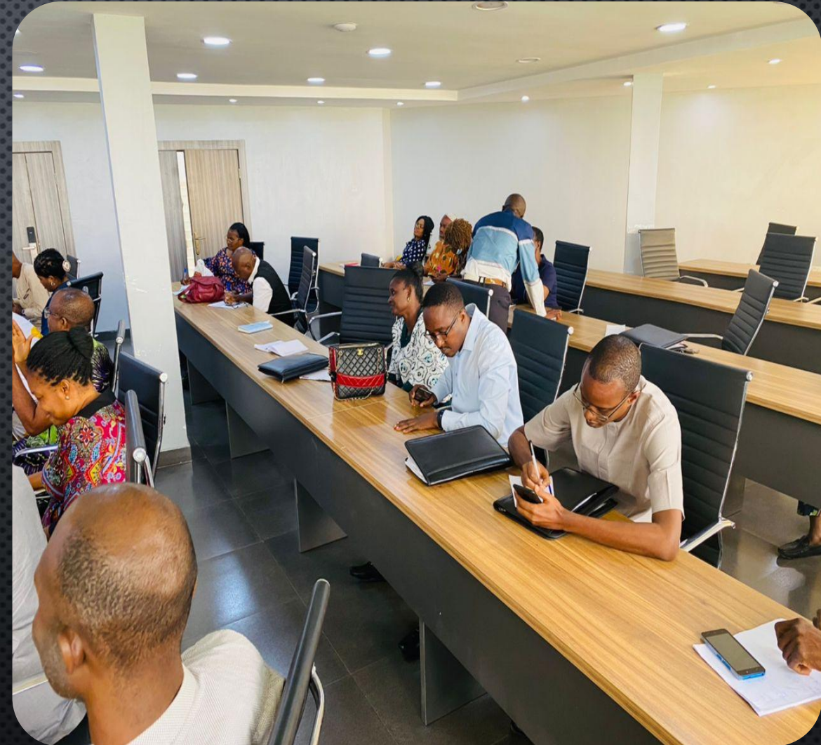
The participants during assessment by the facilitator