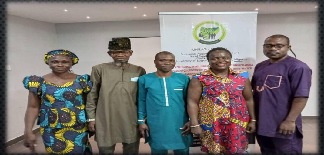
Members of a class Group posing for photograph after group presentation