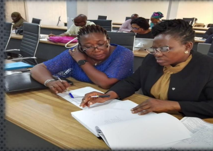
Participants during group work