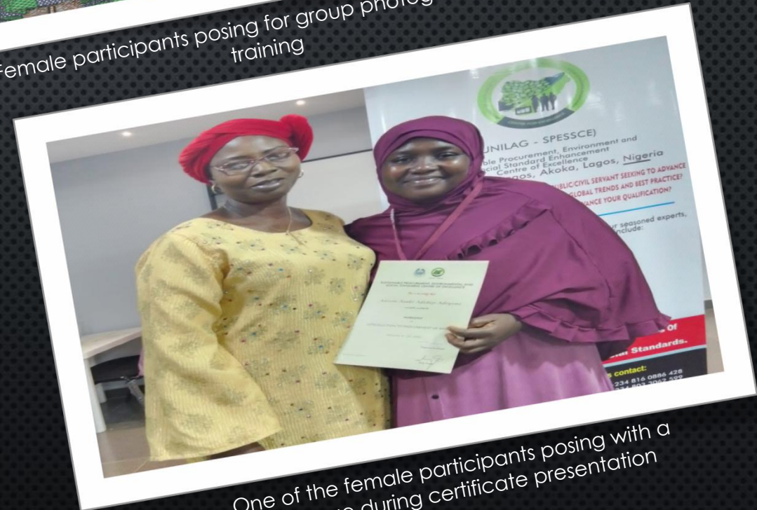
One of the female participants posing with a colleague during certificate presentation