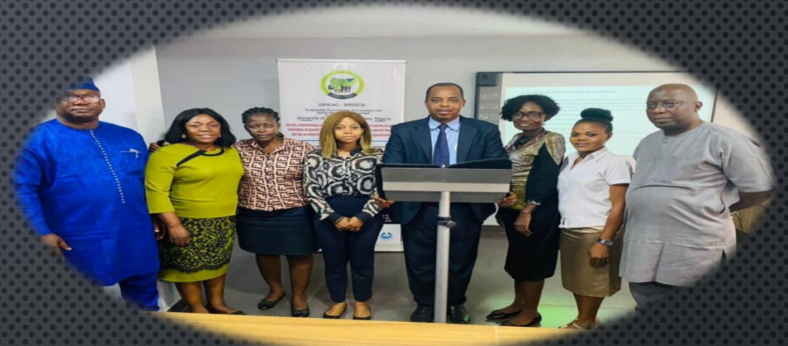
The Centre Leader taking a pose with class group A after group presentation