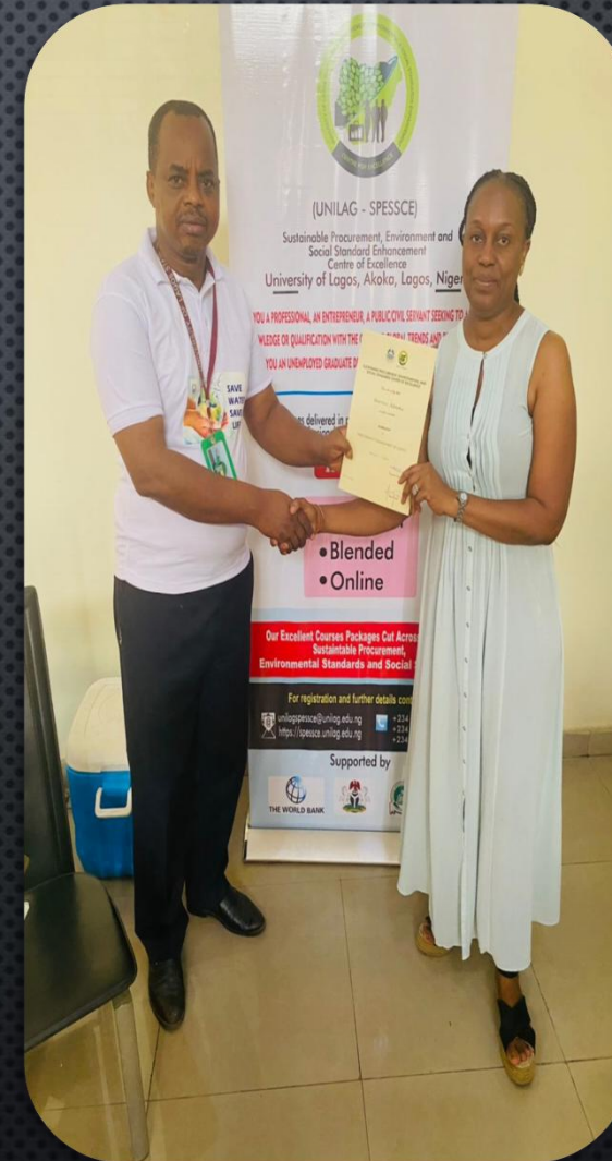
The Centre Leader presenting certificate to one of the female participants, procurement officer from Ikoyi Club