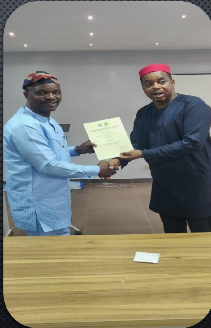
The Centre Leader presenting certificates to the participants on training day 5