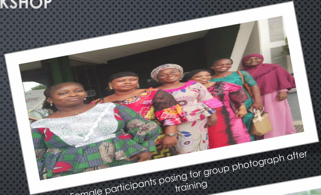
Female participants posing for group photograph after training