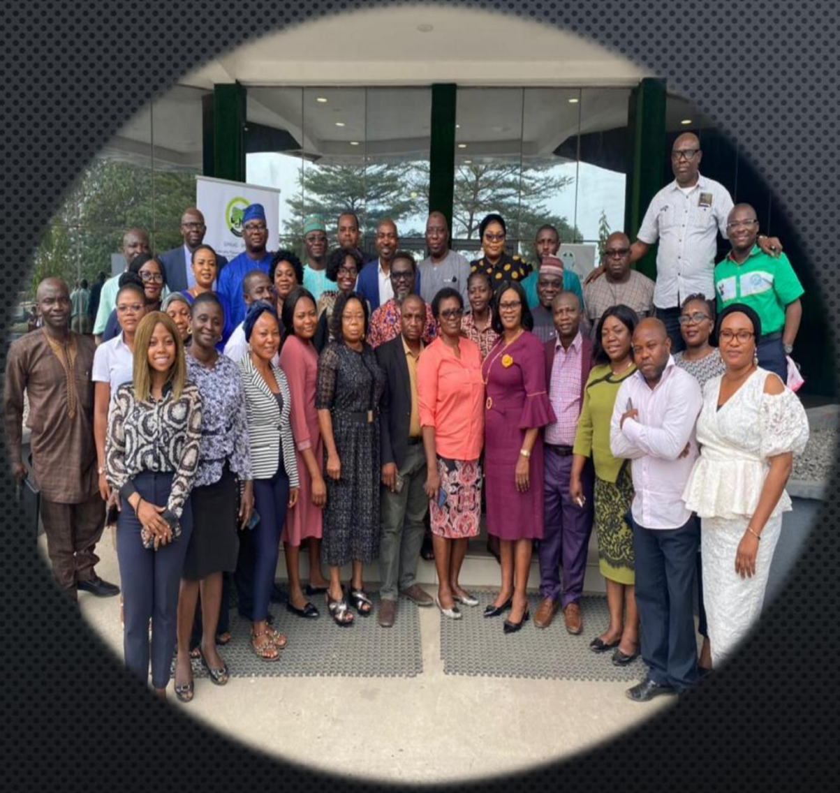
All participants group pictures