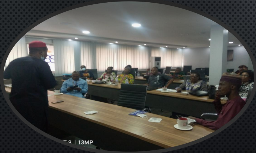
The Centre Leader addressing a the class shortly before presenting the certificates