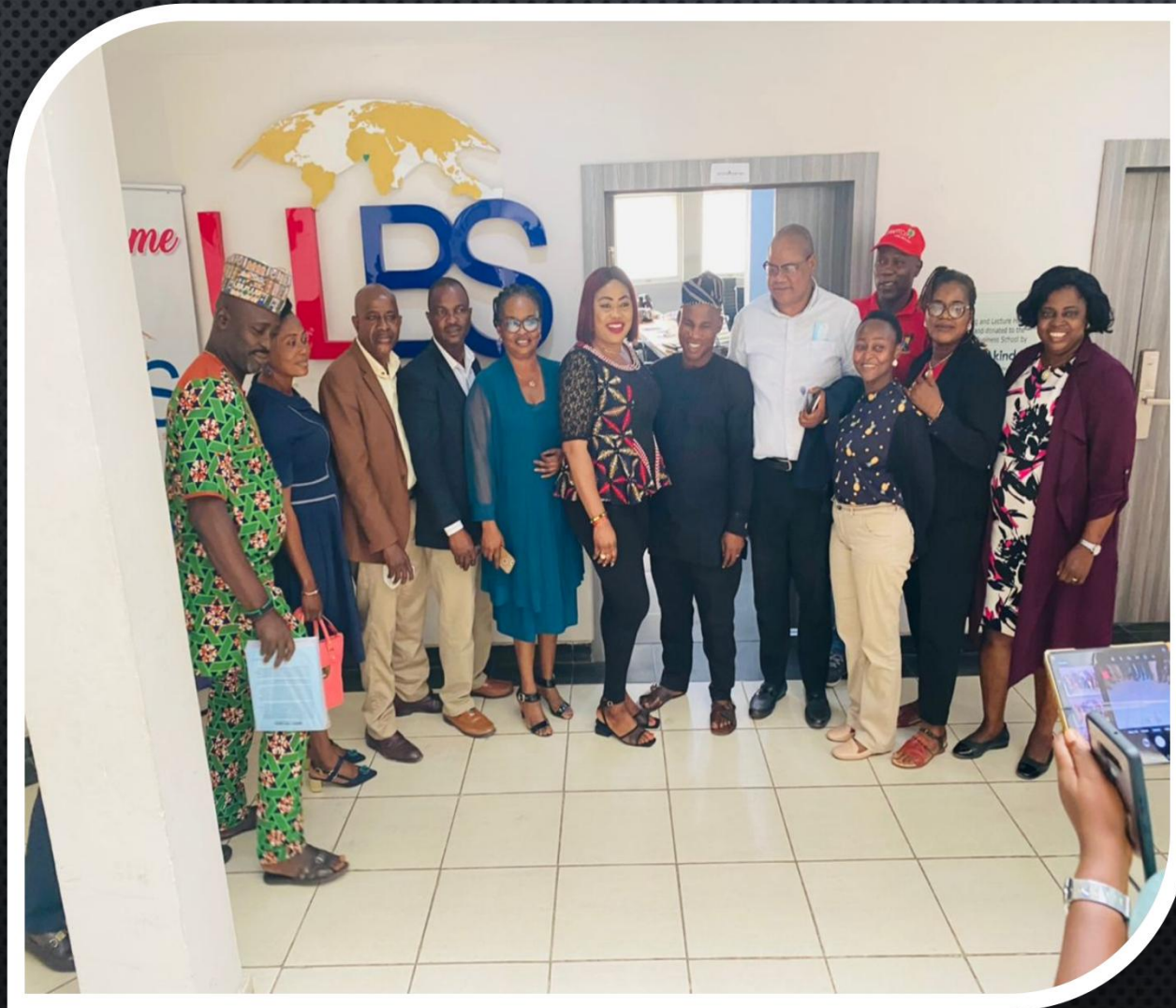
The participants posing with the facilitator after class