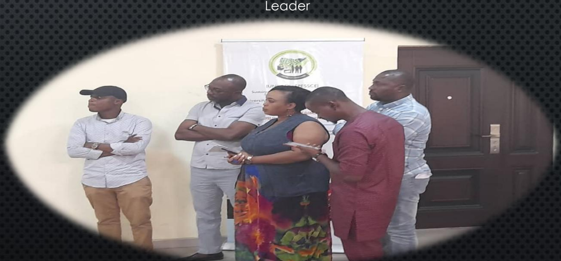
Team member paying attention a speaker during group presentation