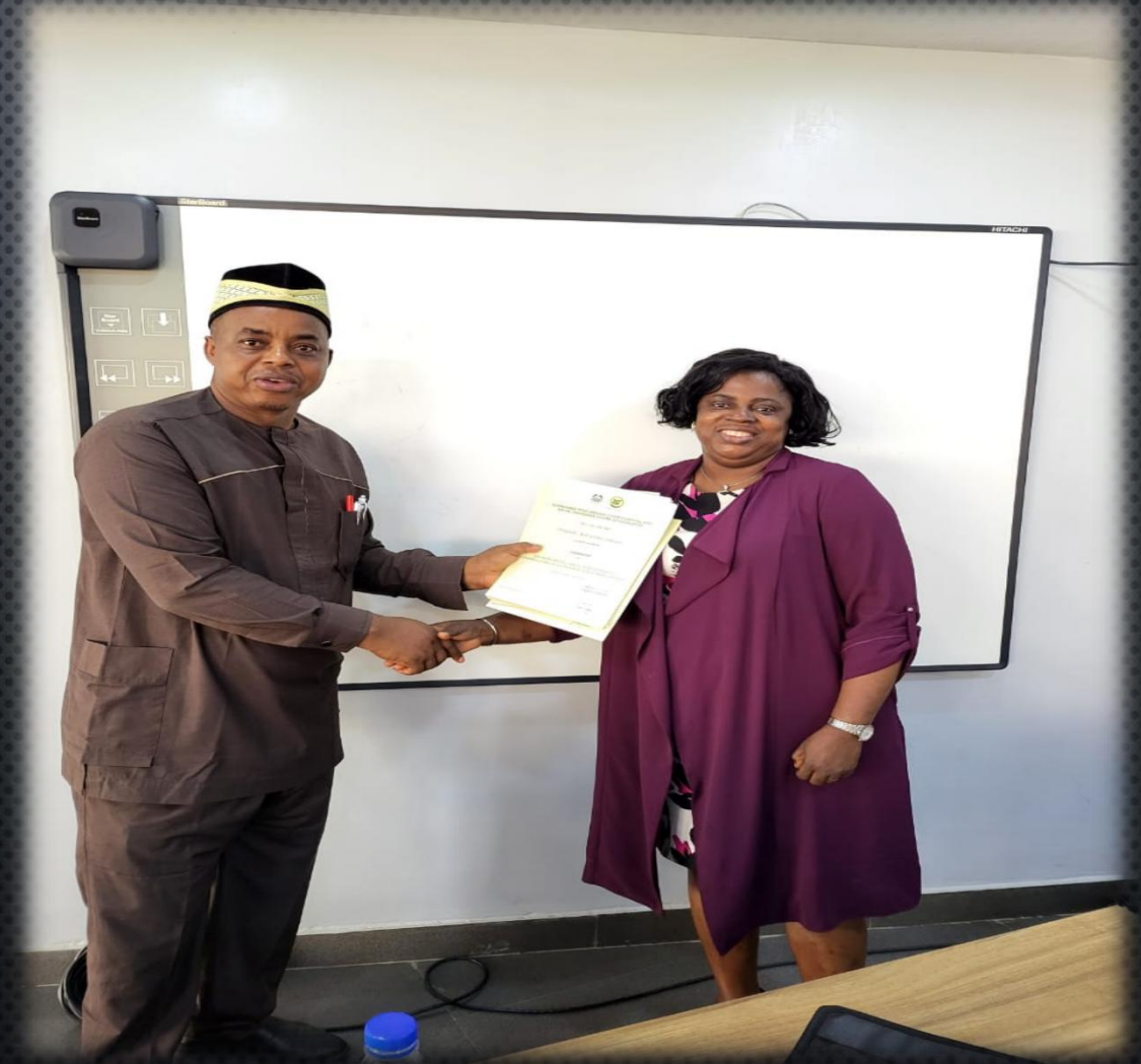
The Centre Leader presenting a certificate to one of the participants from Lagos State Public Procurement Agency