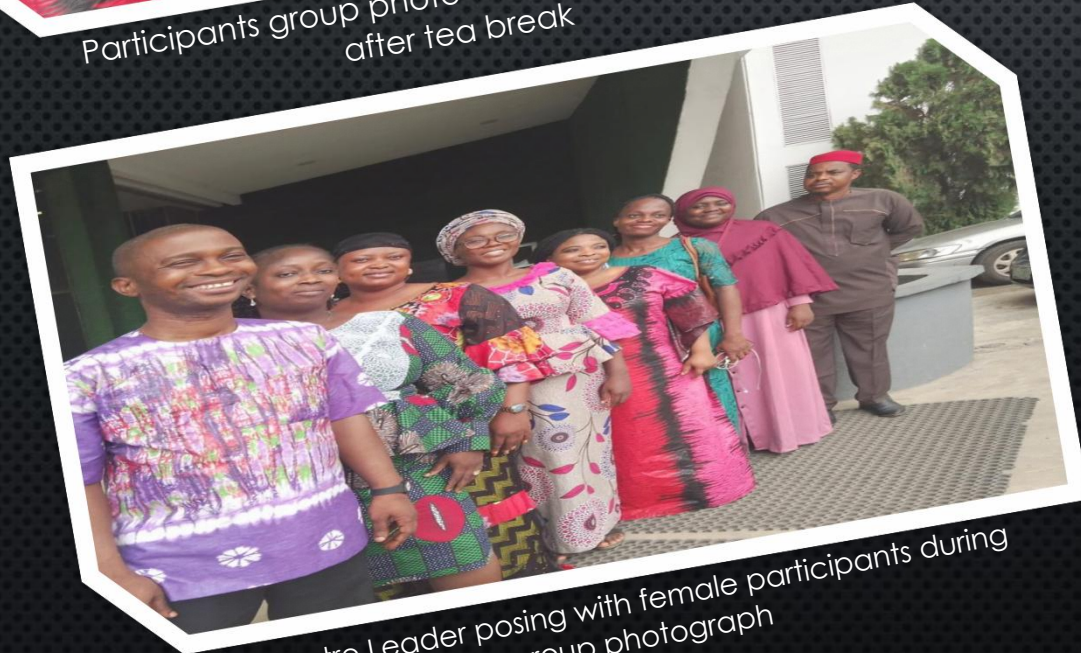
Centre Leader posing with female participants during group photograph