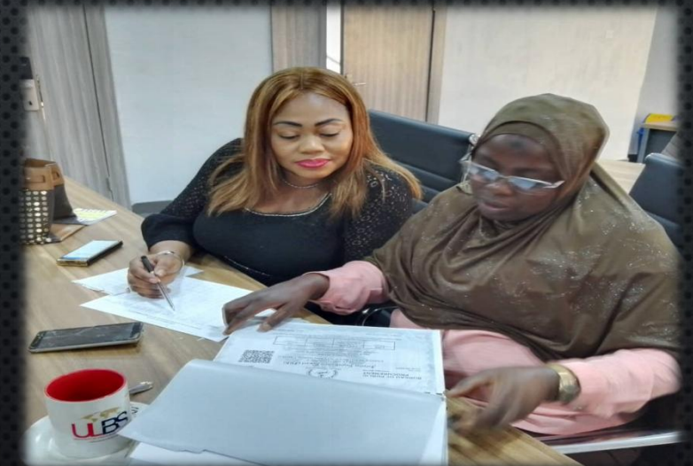
Participants reviewing one the case studies materials during class work